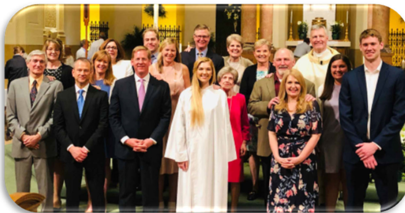
RCIA Group who received their sacraments April 20, 2019, with parish & sacramental sponsors