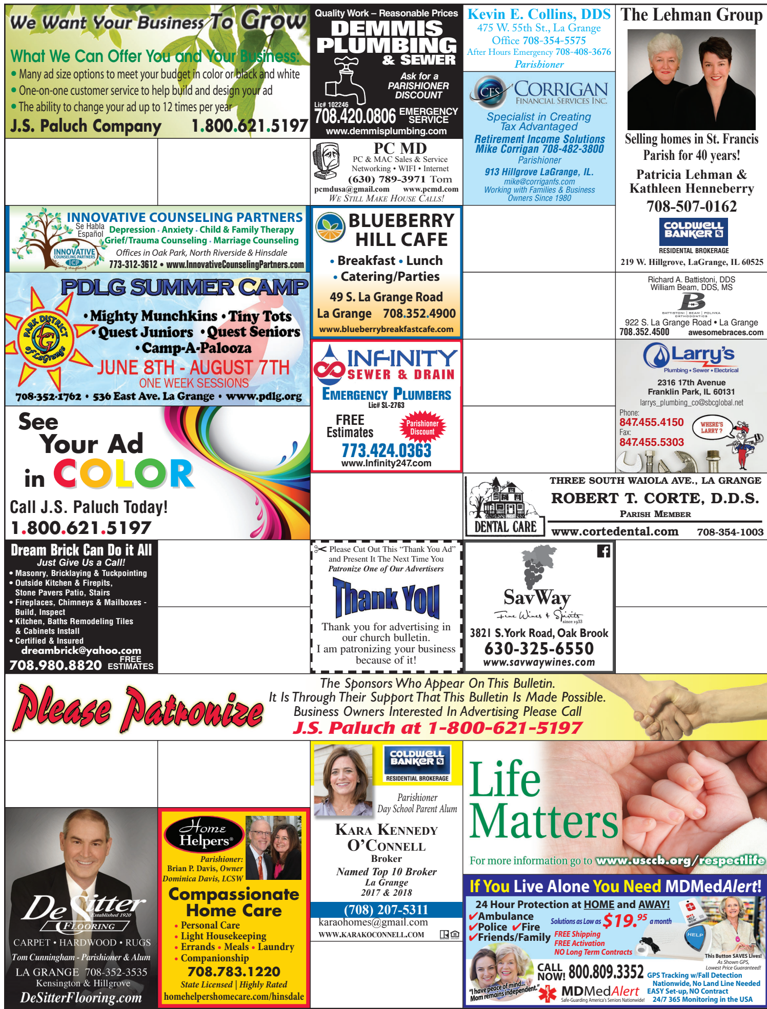
230775 St Francis Xavier Church (A)

For Ads: J.S. Paluch Co., Inc. 1-800-566-6170