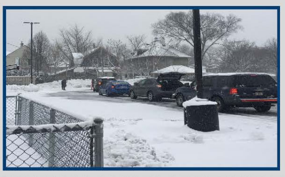
TOTAL BAGS PACKED & DISTRIBUTED: 6469 or an average of 127 bags/week

SPECIAL THANKS for monetary donations. We received over $170,000 ! The outpouring of financial support was beyond anything we could have hoped for and ensures that our Pantry is financially secure to provide long-term recovery from COVID-19 food insecurity. These donations have purchased meat, produce, dairy, personal hygiene products, holiday meal items and special dietary needs for our clients.