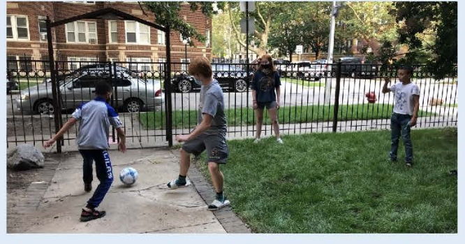
Playing soccer in front of their new home. The brothers, ages 12 and 10, were tough competitors even after their long journey from Jordan!