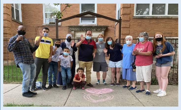
Welcoming the Family of 6 to their new home in Chicago!