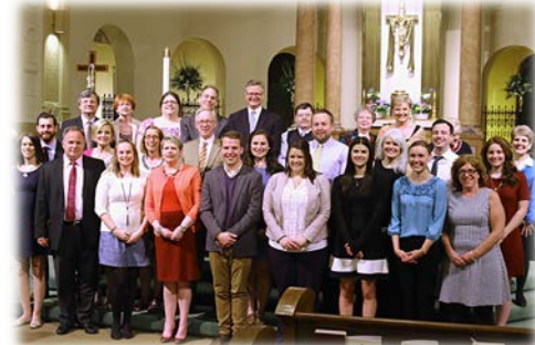
RCIA Group at the Easter Vigil