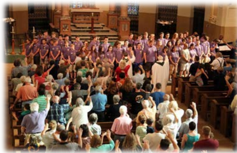
Youth Ministry Mission Trip Blessing

Volunteer Time Commitment - varies. New volunteers are sought each spring and summer.